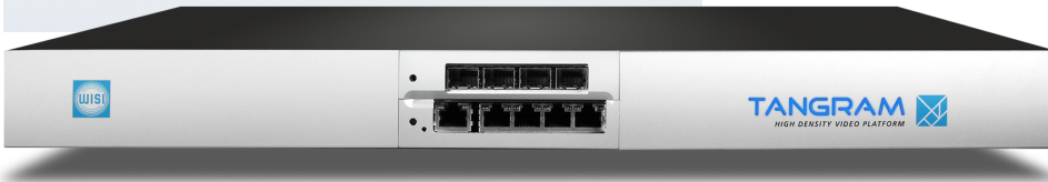
Tangram chassis shown with GT12 module.

Rest easy with reliable 24/7 operation thanks to quality WISI engineering and strong North American technical support