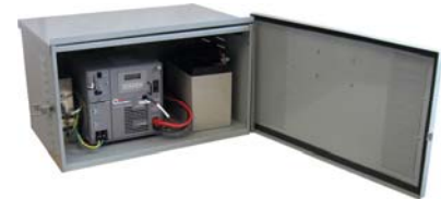
SSP-12 installed in CSEP1-120 enclosure