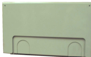
End view showing conduit "knock-outs"