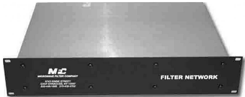
R17700 Rack Mount

Deletes an entire QAM channel for the purpose of reinserting alternate programming (e.g. – Instructional, Security Camera, etc.).