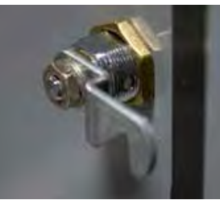
2-point hooked latch locks