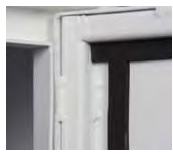
Flush and reinforced door