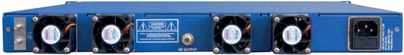
Concierge Rear View