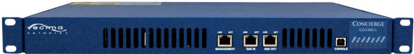
Concierge Front View

The Concierge IP to QAM is a flexible solution allowing cable and satellite operators to offer digital video services to their customers. As an Edge QAM, Concierge can easily be integrated into the headend to extend digital network infrastructures. Concierge is also a cost effective gateway solution for delivery of Free-to-Guest digital video entertainment to MDUs and hospitality accounts. The Concierge CG12M2+ will pass through clear or pre-encrypted input IP content to output QAM. The Concierge CG12M4+ will encrypt clear input IP content using Pro:Idiom® hospitality technology before passing to output QAM.