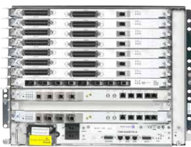
7360 ISAM FX-8 – VDSL2 Vectoring shown