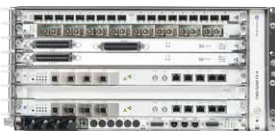
7360 ISAM FX-4 – Multi-service shown

With three 7360 ISAM FX shelf sizes to choose from, service providers have maximum flexibility for deploying in central office, outside plant cabinet or other remote environments. With the 7360 ISAM FX, operators have the flexibility to deploy a mix of technologies that can deliver fast broadband, a faster time to market and the fastest possible return on investment.