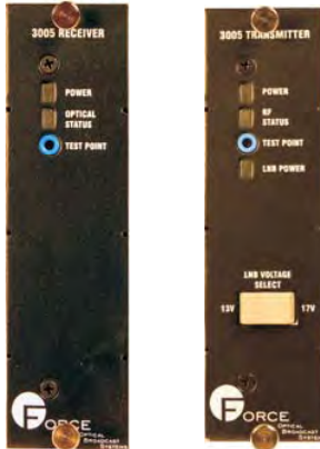
Model 3005PRO Transmitter and Receiver Front Panels