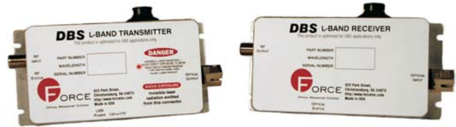
Model 2990PRO: Stand-alone Transmitter and Receiver

The Model 2990PRO L-Band Satellite Transport System provides an economical solution for transporting digital signals for numerous satellite distribution applications, including headend relocation, and distribution of digital broadcast systems (DBS). The system utilizes a cost-effective coax cabling configuration to distribute the RF signals from the dish to the transmitter and from the receiver to the headend. The single-mode optical fiber between the 2990PRO transmitter and receiver allows transmission distances to 35 km at 1310 nm. Furthermore, using LNB power from the transmitter decreases the need for additional equipment at the dish site. RF alarm and indicator LEDs allow for a quick assessment of the link's operational status. The Model 2990PRO L-Band Transport System, whether used in an antenna remoting application or in a satellite distribution role, provides for transmission of the entire DBS spectrum in a simplified, flexible installation environment at one of the lowest costs found in today's market.