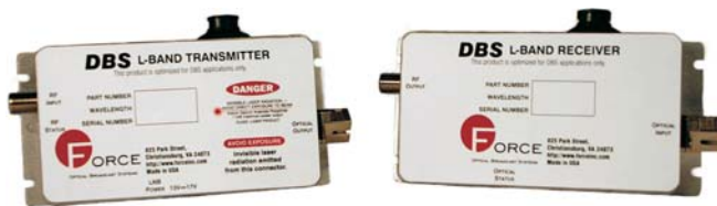
Model 2990PRO: Stand-alone Receiver and Transmitter