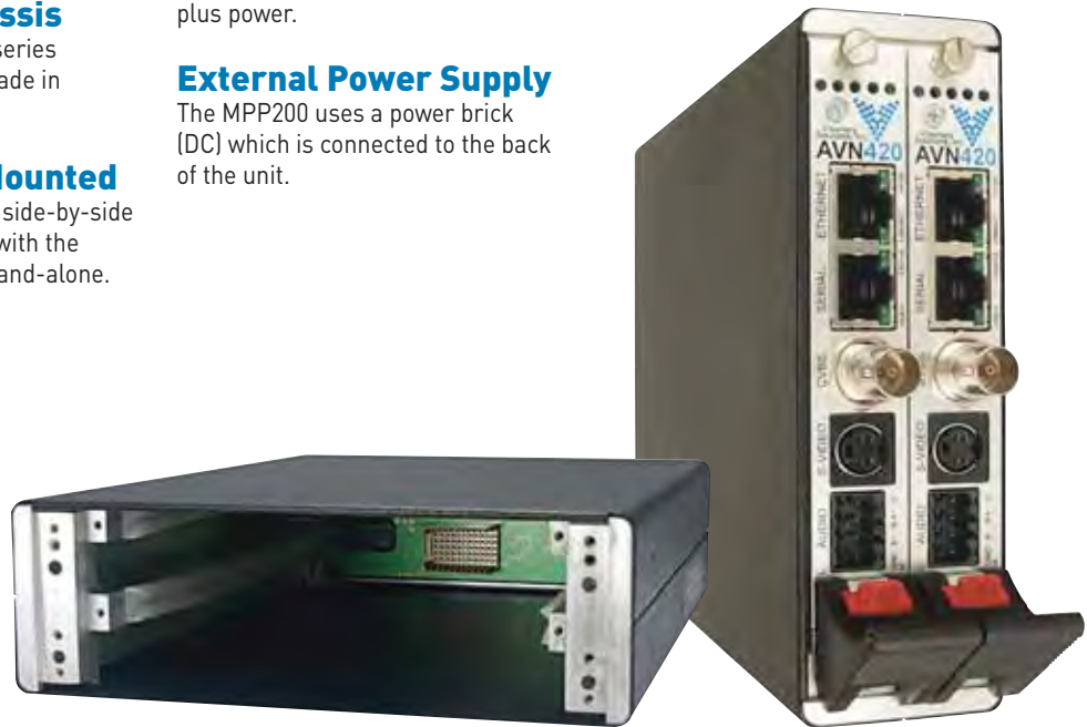
The MPP200 shown empty and with two AVN420 encoder blades installed

The MPP200 uses a power brick (DC) which is connected to the back of the unit.