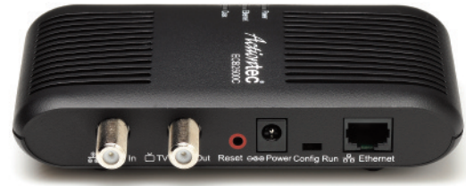
Back of Unit