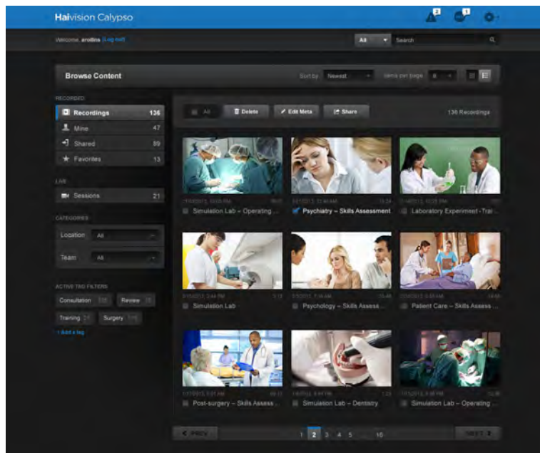
Calypso Content Browser